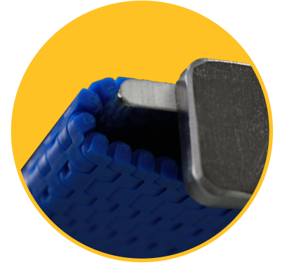
-OPTIONAL-LOW PROFILE NOSEBAR