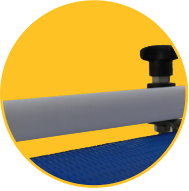
-OPTIONAL-ADJUSTABLE GUIDE RAIL