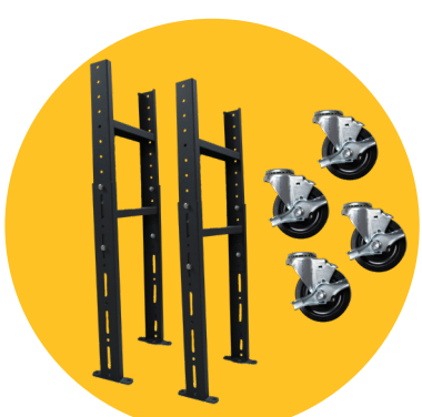
-OPTIONAL-SUPPORTS & CASTERS